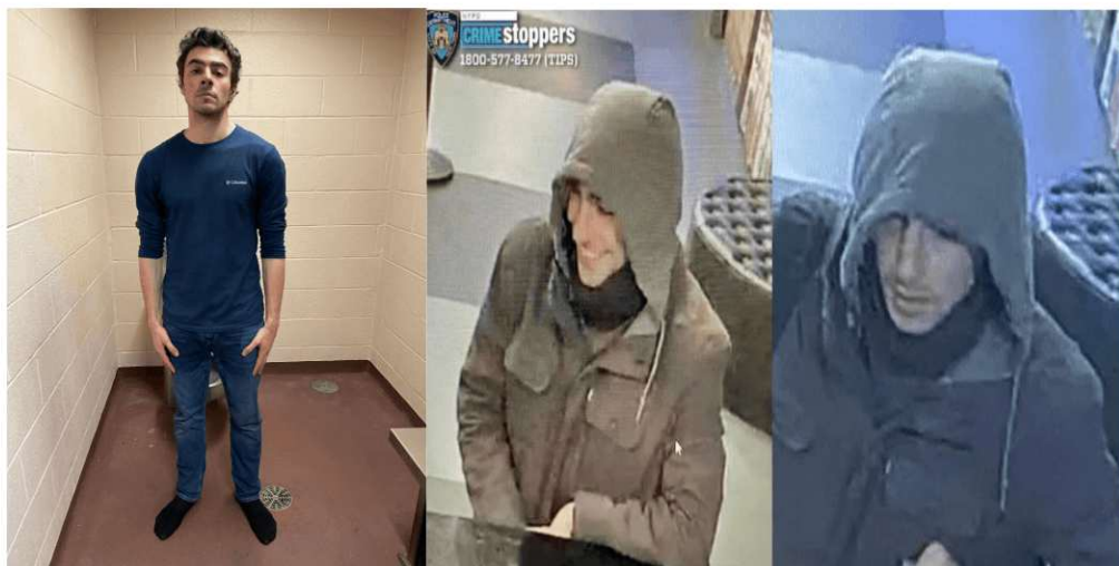
(On left: arrest photograph of MANGIONE. On right: the Shooter at the Hostel.)

9. Based on all of the above, my review of photographs of the Shooter, and my review of arrest photographs of LUIGI NICHOLAS MANGIONE, the defendant, I respectfully submit that MANGIONE is the Shooter who shot and killed the Victim on December 4, 2024. Additionally, the Notebook entries, the Feds Letter, the Shooter’s apparent surveillance of the Midtown Hotel on November 24, 2024 and December 4, 2024, and the Shooter’s use of countersurveillance techniques and escape from New York City all suggest that the Shooter undertook extensive efforts to identify the Victim, place the Victim under surveillance, and track the Victim’s whereabouts in the time period leading up to the murder. Below are surveillance stills of the Shooter and an arrest photograph of MANGIONE: