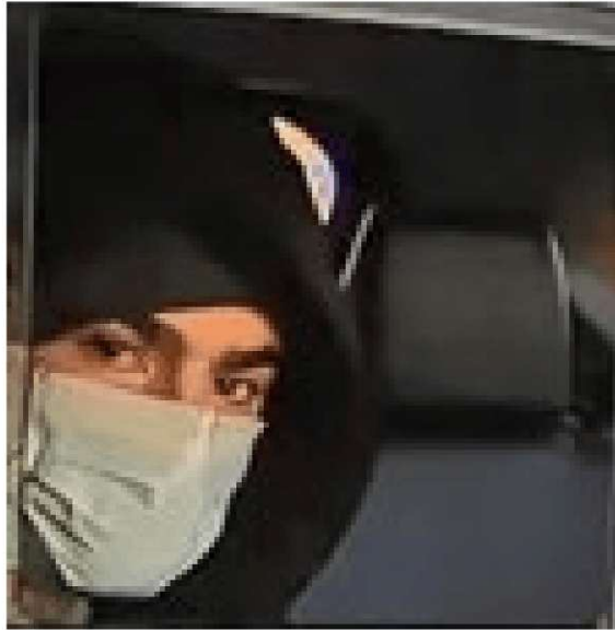
(The Shooter inside the taxi.)

WHEREFORE, I respectfully request that a warrant be issued for the arrest of LUIGI NICHOLAS MANGIONE, the defendant, and that he be imprisoned or bailed, as the case may be.